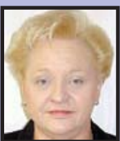
Mayor Caralee Mayer Precinct 1