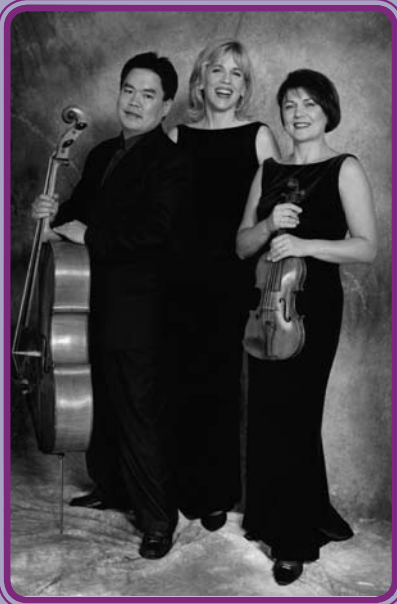
The Merling Trio takes the stage in April.

Come and join us for some fun and exciting events!