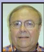
Vice-Mayor Karl Littman Precinct 4